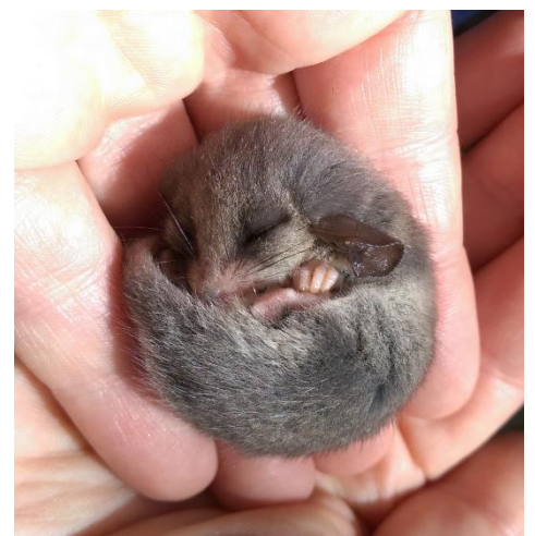
Eastern Pygmy Possum

We look forward to welcoming you to spend time with AWC field staff and learn how AWC is helping to restore our natural assets to this iconic headland on Sydney's doorstep.