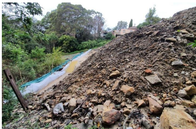
Pathway development. Huge sediment pile and totally inadequate controls for it, especially given the steep slope

It is under threat from the already significant downslope impacts of the Pathways development including both damage and physical encroachment, despite the fact that "Extensive conditions are included in development consent conditions." So the Society called for stronger infrastructure, the provision of double fencing on steeper sites with at least one of the fences to be 2m high steel fencing properly anchored in the ground. Council responded that "controls are the responsibility of the Private Certifier. Council will liaise with them in regard to sensitive