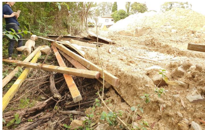
Next to the Angophora is this pile of building materials which has been washed downslope and will now be trashed by builders – they are obviously not even adequately containing their own materials.