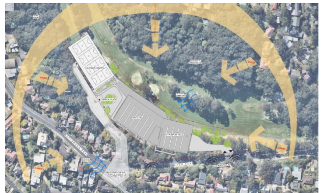
Roundabout at Stevenson St into the Golf Club 'Sport & Rec.' facility - from LC Council's Draft Development Application