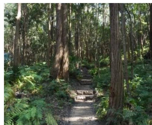
Lane Cove Bushland Park

The Society supports the LCC Bike Plan but has strongly opposed tracks in narrow wildlife reserves/bushland, including this proposal.