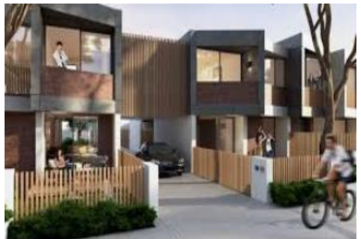
Medium density development

Sadly, the last NSW Labor government was responsible for introducing the 'complying development code' (CDC for single houses), a process that has been enthusiastically continued by its successors.