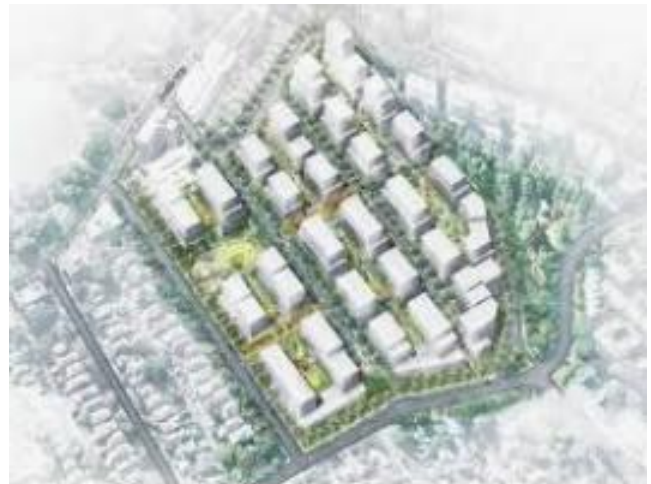
Lane Cove Council - St Leonards South ... lanecove.nsw.gov.au

It is now crucial for the Greenwich Community Association- St Leonards South groups to get a commitment from Labor regarding the plan before the State election this March.