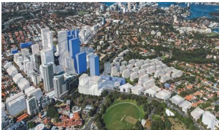
Crows Nest & St Leonards South development

The email included information about how to submit your comments to the Department of Planning.