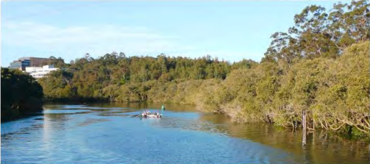
Mangroves along the shoreline of Cunninghams Reach, 2014. L. McLoughlin

This 2 nd edition (2017) updates Lynne's earlier book 'The Natural Environment of Lane Cove' , published by Lane Cove Council in 1992 (reprinted 2014), is filled with many gorgeous photos of local wildlife, plants and landscapes to inform and delight both adults and children.