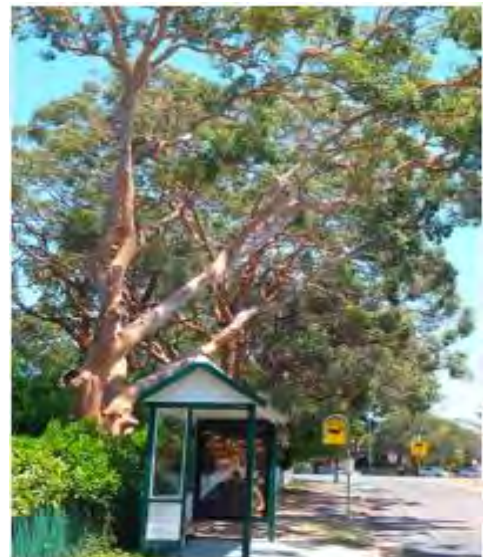
Sydney Red Gums are a Lane Cove signature tree.