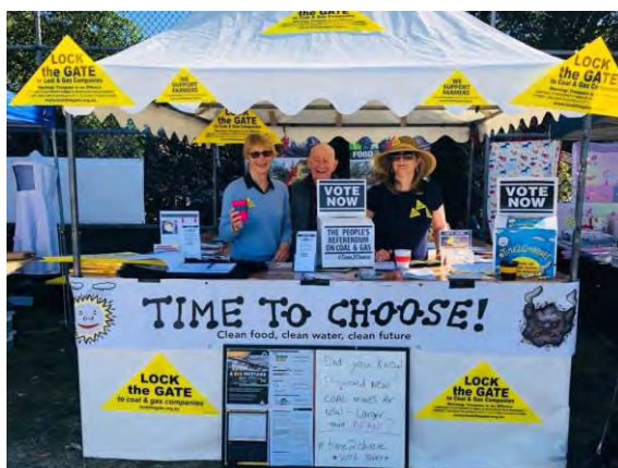
Lane Cove Coal & Gas Watch stall @ Hunters Hill Moocooboola Festival, Sunday 5 th August 2018