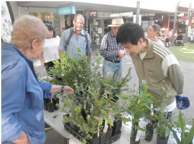
He bought $50s worth!